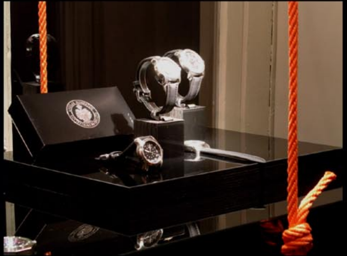
Presentation on „Black Damascene“ display