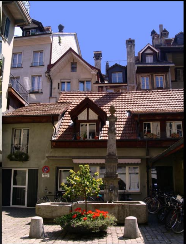
View from the TIME GALLERY/1