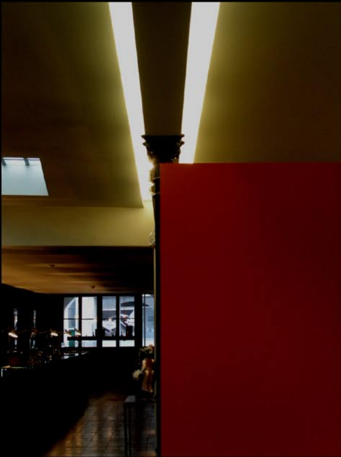
Orange gallery wall