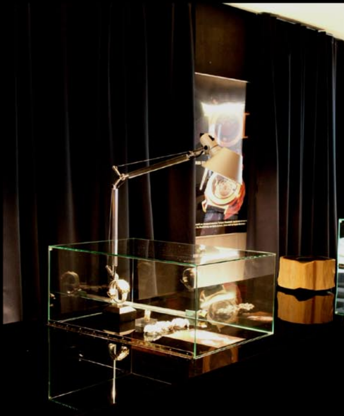
Showcase for Time Explosion and La Vie en Rose