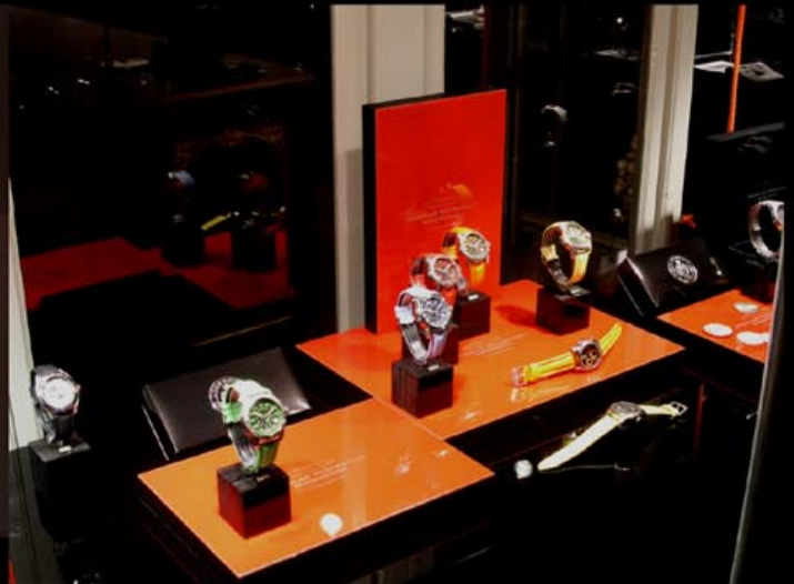
Presentation on „Black & Red Damascene“ display