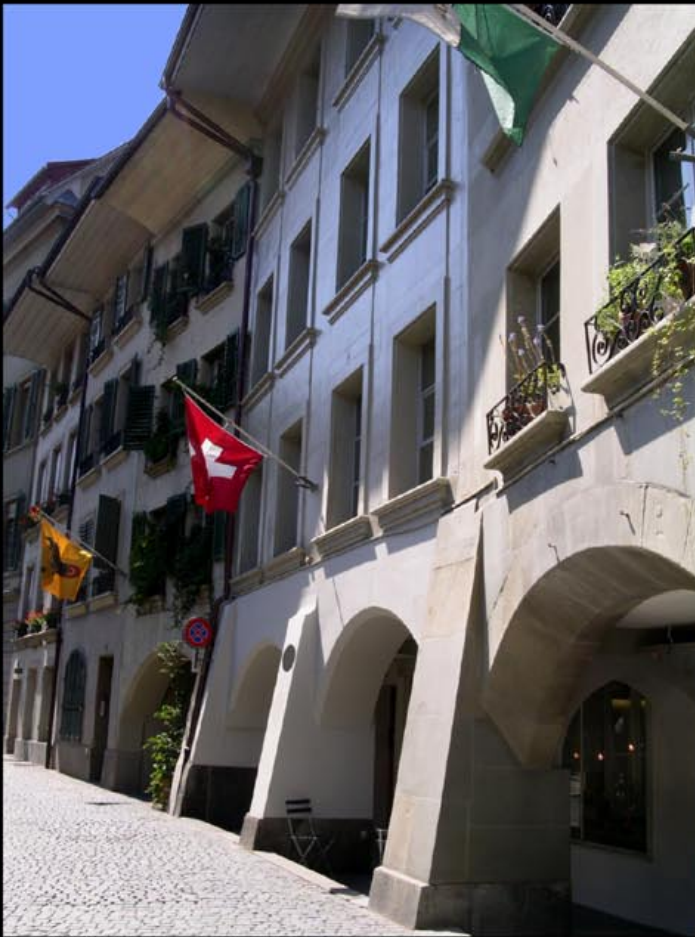
Historical building of TIME GALLERY/1