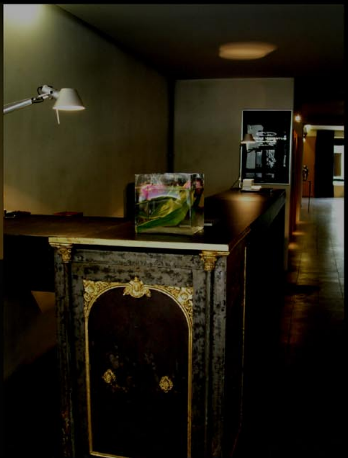
Main desk seen from entrance