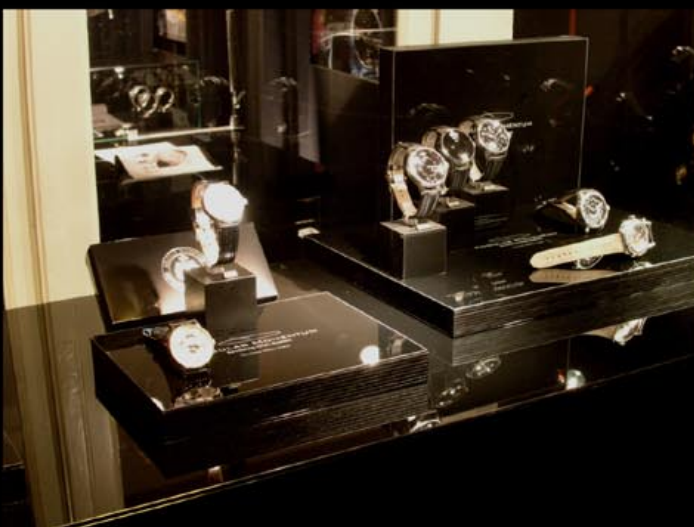
Presentation on „Black Damascene“ display