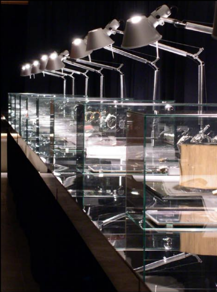
Showcases & Lamp allee on sales altar