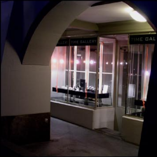
Time Gallery/1 main entrance