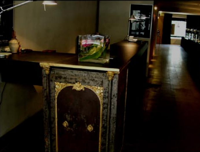
Desk with antique safe