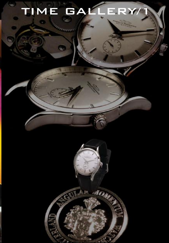
Street poster campaign for Tago Olsen handwinder