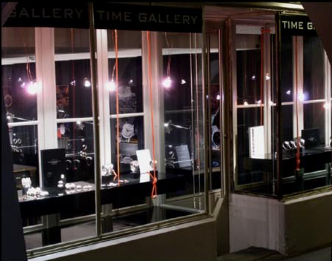
Shop front window