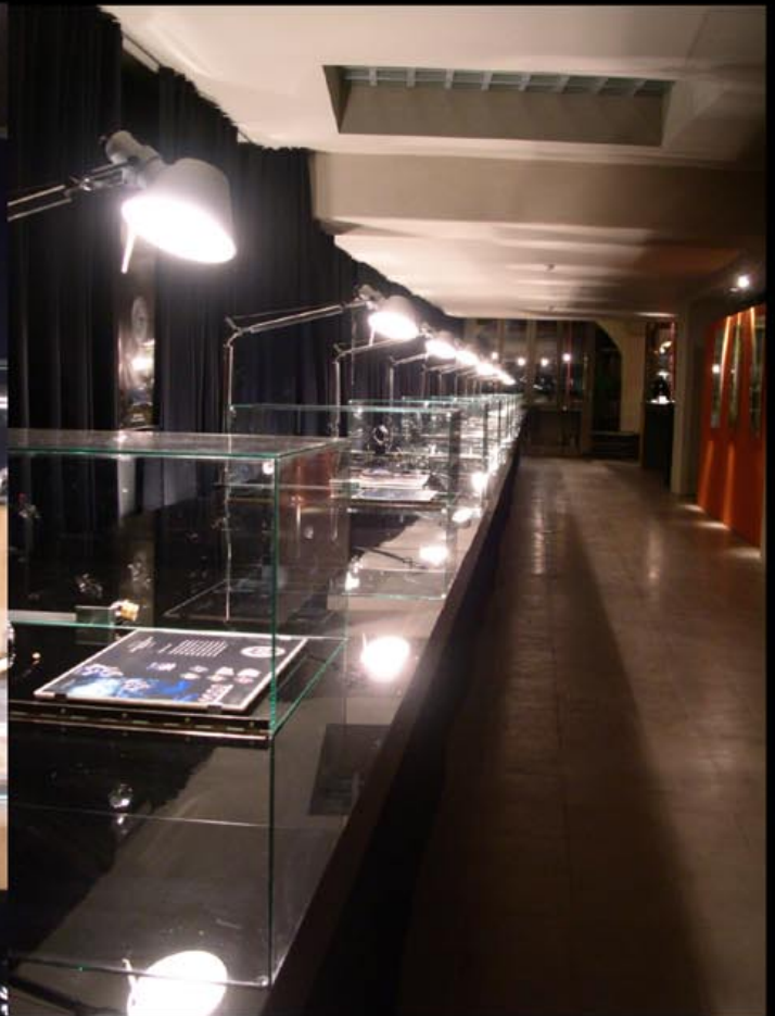
Gallery of show cases on sales altar