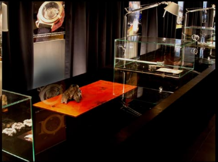
Showcase for COLOR-TEC collection