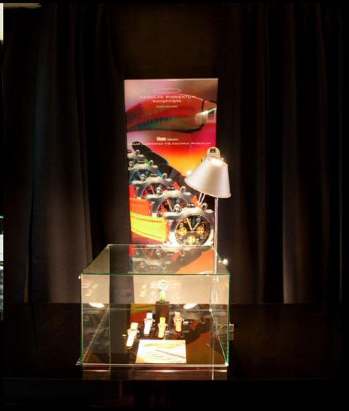
Showcase for Illum Color collection