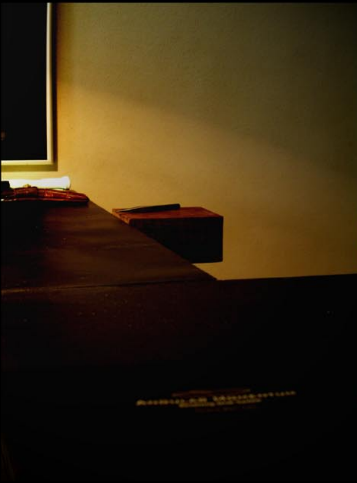
Watch maker station