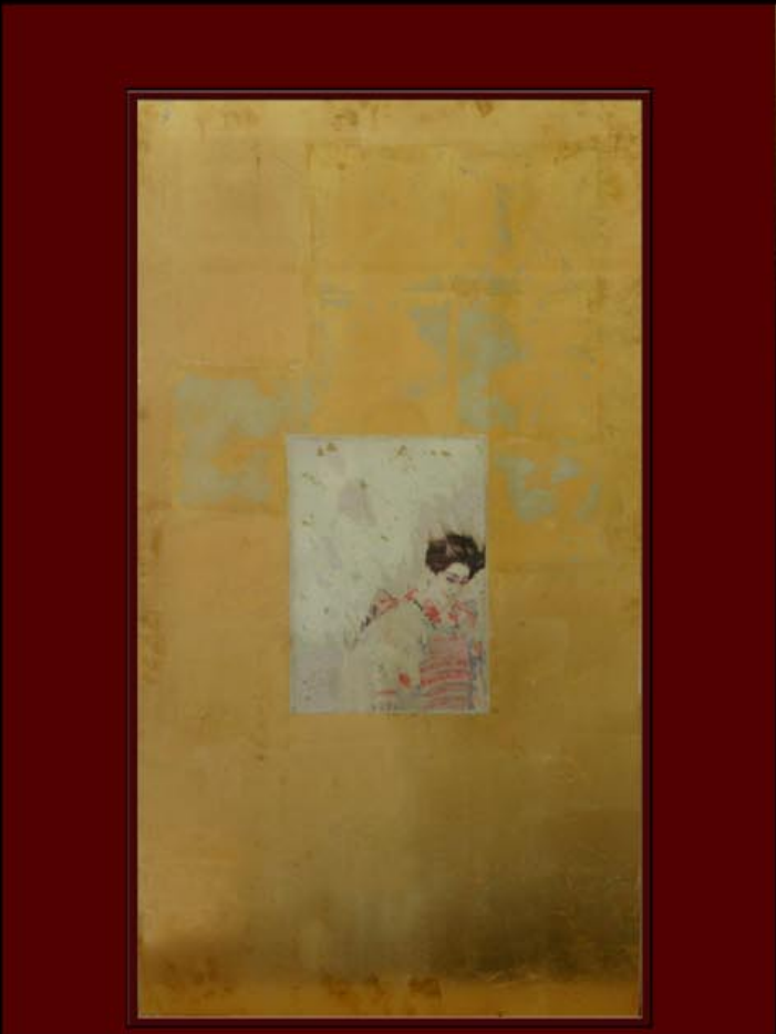
Glass & Gold art object