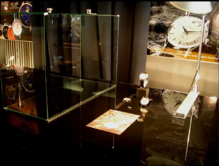
Open Tage Olsen collection showcase