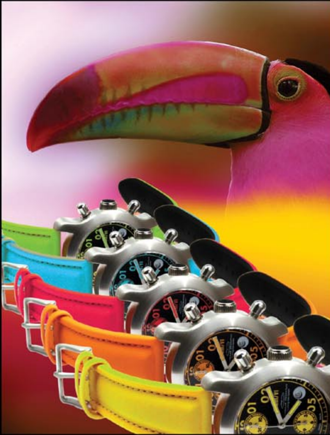
Street poster and ad for grand opening event