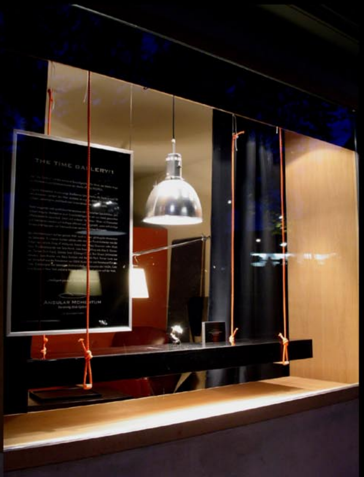
Shop window back entrance of TIME GALLERY/1