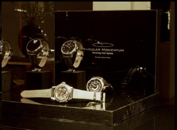
AXIS watches on shop display „Black Damascene“