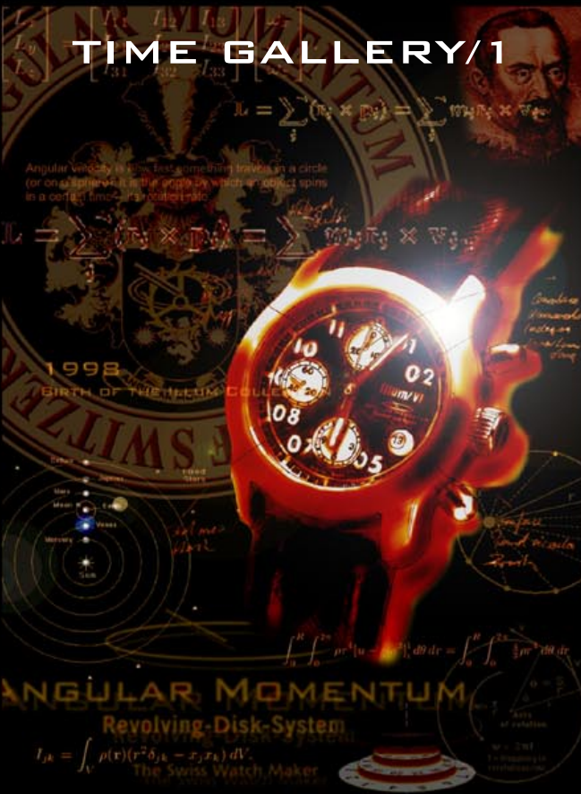
Street poster for Illum's 5th year anniversary