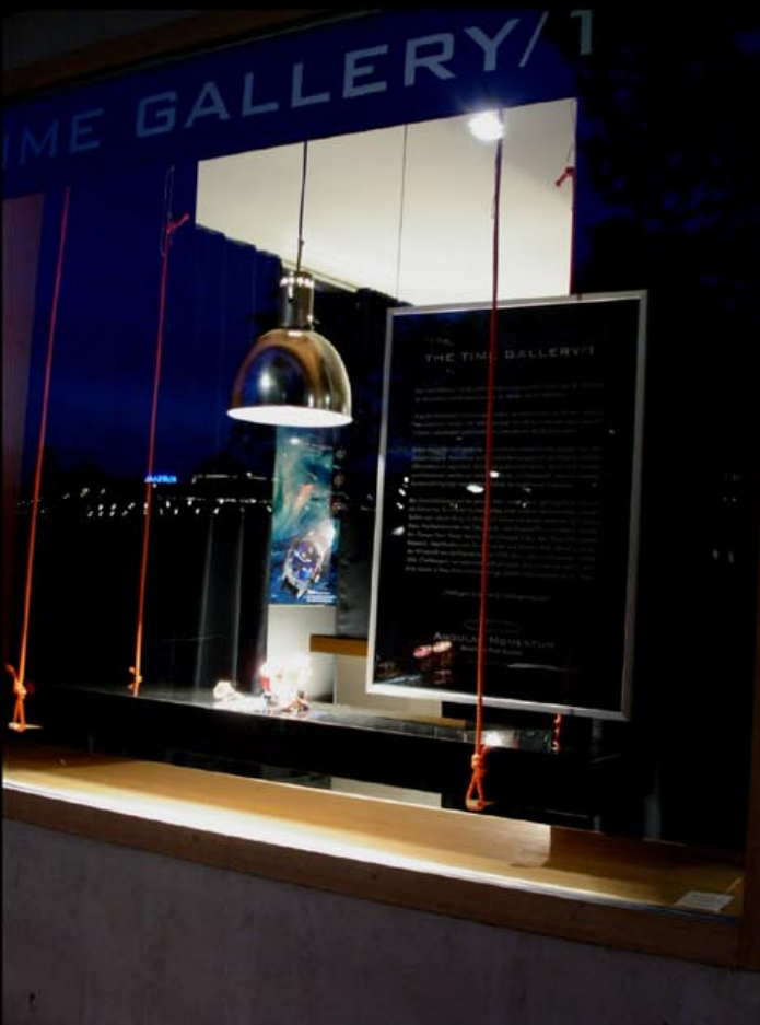
Shop window back entrance of TIME GALLERY/1