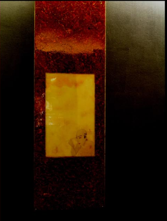
Lacquer object, similar technique like Tec & Art