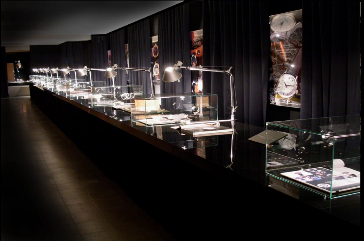
View from main entrance