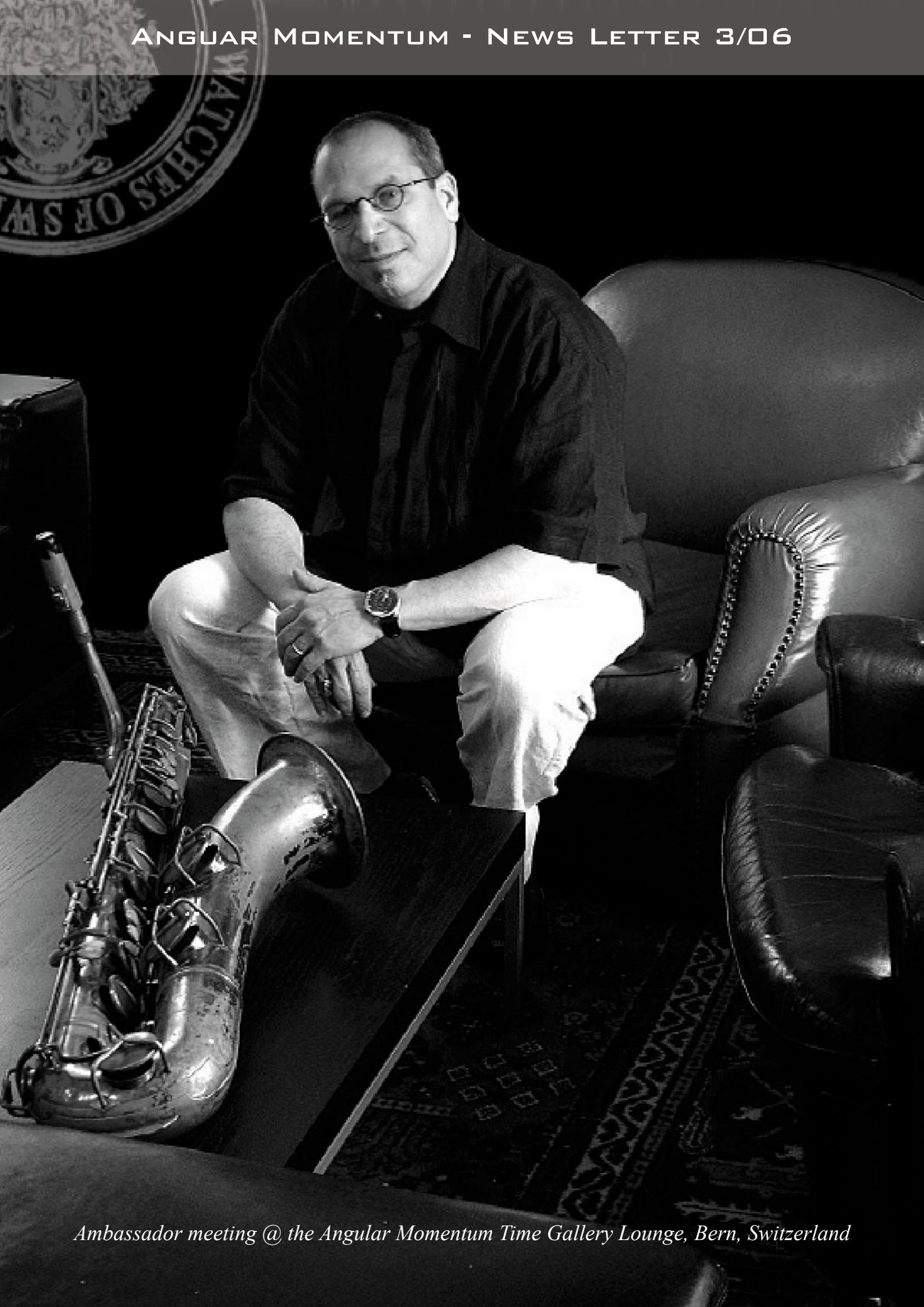
Ambassador meeting @ the Angular Momentum Time Gallery Lounge, Bern, Switzerland